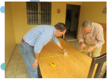
May Got projects done around our house.