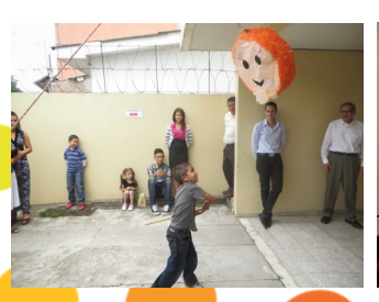
September Celebrated Children's Day.