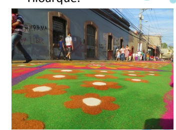
April Easter week celebration. Sawdust carpets in downtown Tegucigalpa.