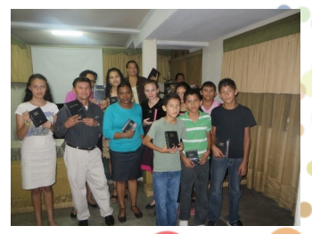
June Bibles are distributed.