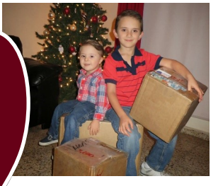
Jan. Christmas boxes arrive from Beavertown