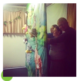
June Youth teaching children.