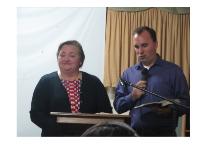
Sharing her life story.