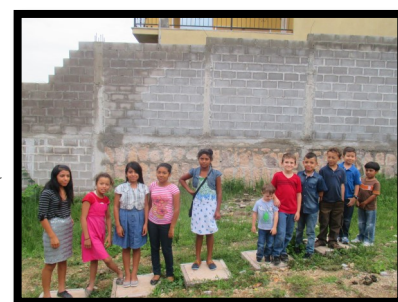
Children in Las Uvas getting ready for a presentation in the service.