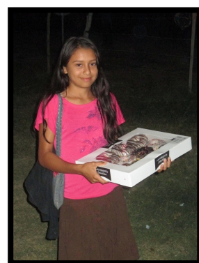
selling doughnuts to raise money for the church.